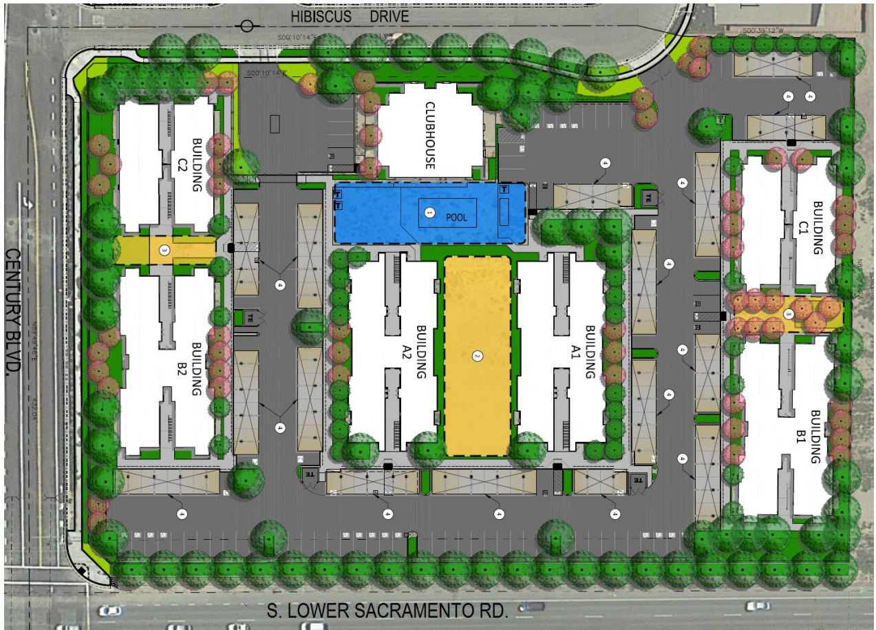
Site Plan – North →