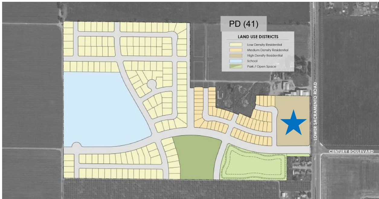
PD 41 Land Use Map adopted April 9, 2014 with 88 RHD Units